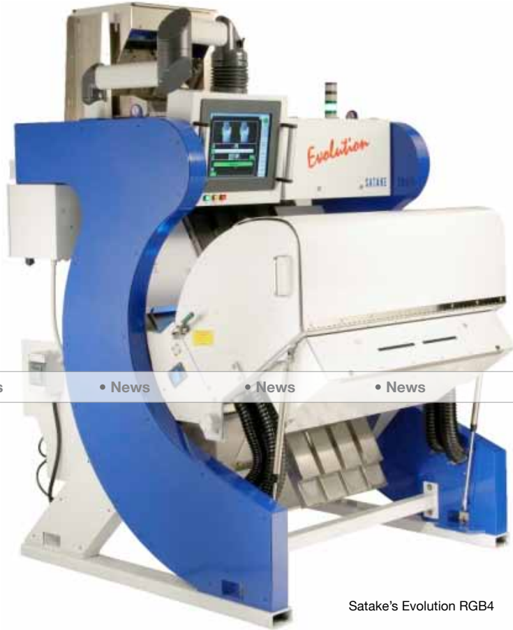
Satake's Evolution RGB4

• News • News • News • News • News • News • News • News